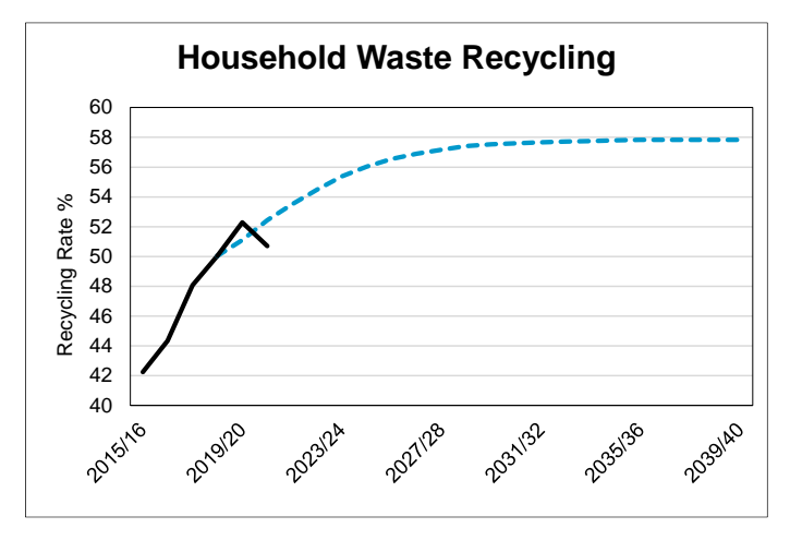
Figure 6: Household Waste Recycling in Northern Ireland

20. Recycling . Figure 6 shows the projected development of Household Waste recycling in Northern Ireland assumed in the September 2020 report (blue dotted line) and the actual reported recycling rates (black solid line). As Figure 6 shows, there was a significant increase in Household Waste recycling pre-COVID-19 in 2019/20 when the rate increased to 52.3% but during 2020 it fell back to 50.7%.